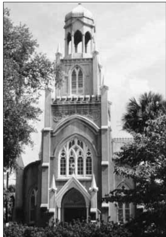
Mickva Israel, Savannah, Georgia

Upon settling in Georgia, the Savannah Jews probably held services in the homes of members. In July 1735 they “met together, and agreed to open a Synagogue...which was done immediately, named K. K. Mickva Israel” (Kahal Kodesh Mickva Israel which is translated as Holy Congregation Hope of Israel).